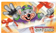
CHUCK E. CHEESE