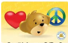
BUILD A BEAR